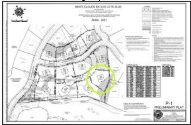
White Clouds, Phase II | Lot 40