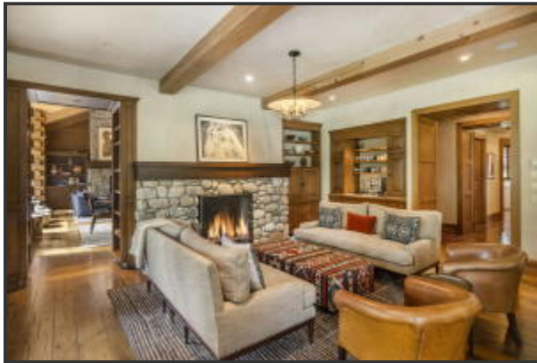
Den off Kitchen