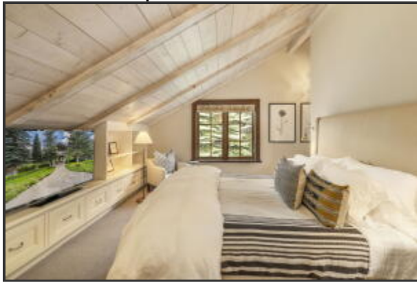
Upstairs Bedroom 3