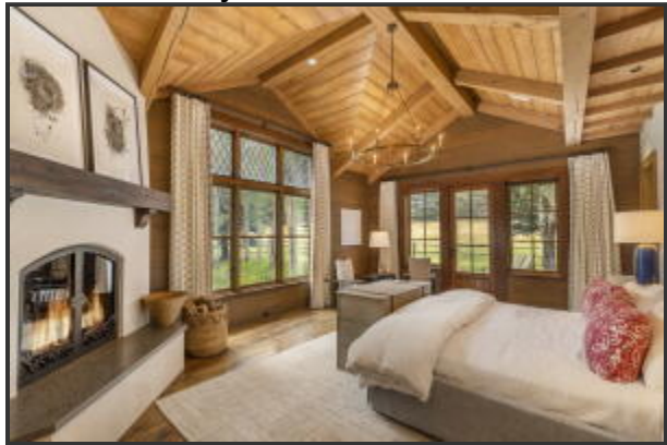
Primary Bedroom on Main Floor