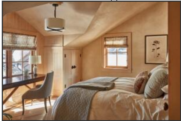
GS Bedroom (5)