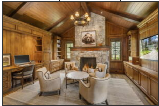
Office (Possible Bedroom 6)