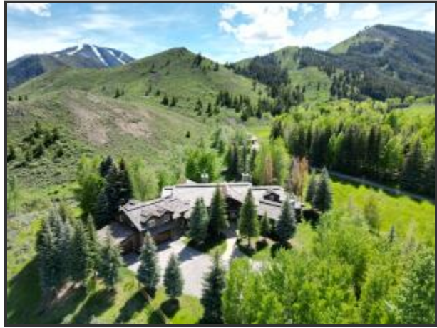
71 Adams Gulch