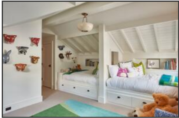
Bunks in Bedroom 4