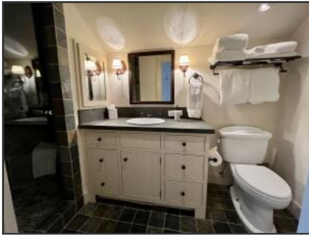
Bathroom for Bedroom 4