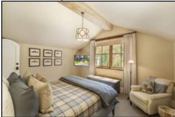
Upstairs Bedroom 2