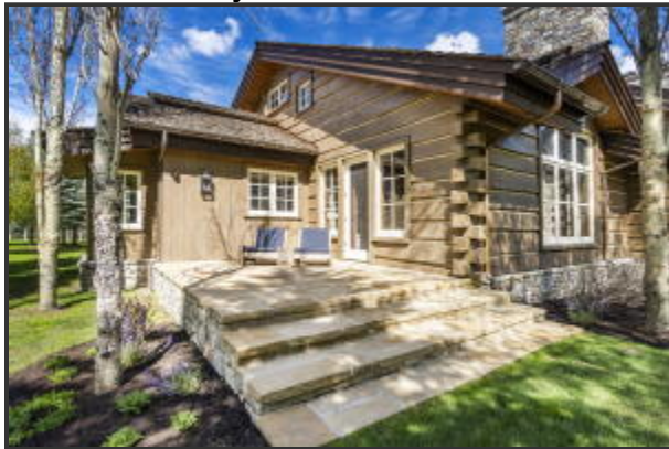
Primary Bedroom heated deck