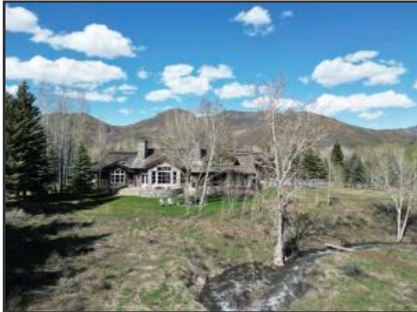
71 AG Back Yard & Creek